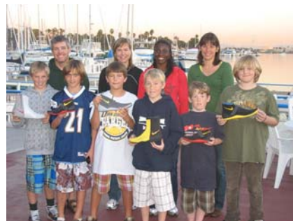
Nike & CYC Jrs.