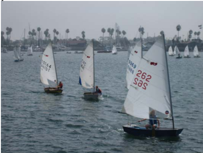
ABYC Fall Junior Invitational